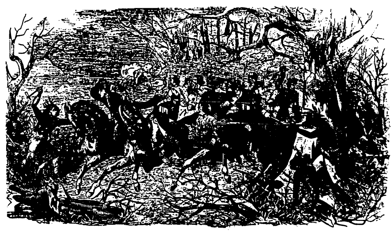
Battle of Tippecanoe